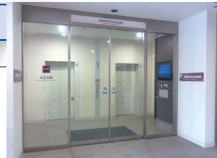
1F Elevator Entrance